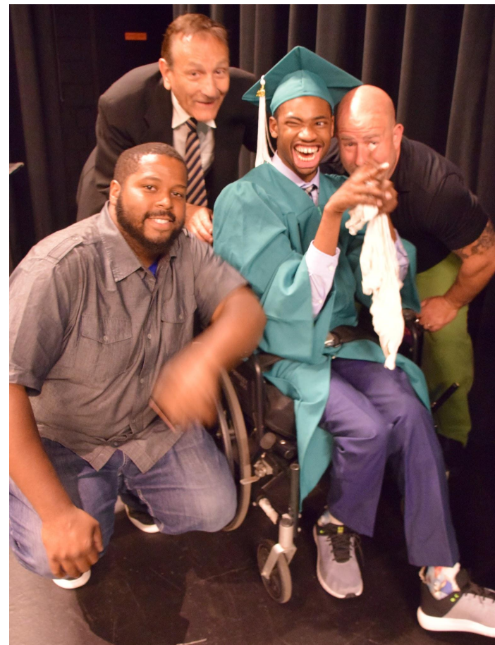
Source: DESE Profiles, Sept. 2021